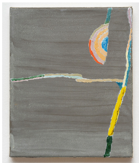
Betula 7 , 26x21 cm, Oil on Canvas, 2022