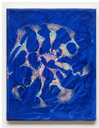
Hard Boiled Babe 3 , 26x21 cm, Oil on Canvas, 2022