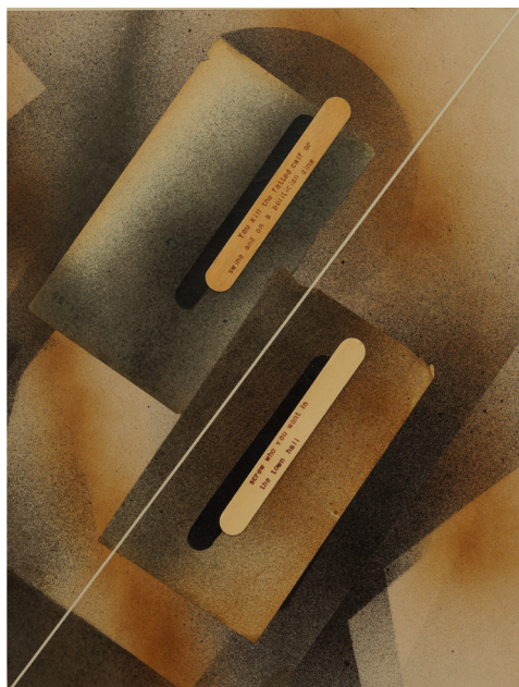
No. 6, 2019, Collage, 50cm x 40cm